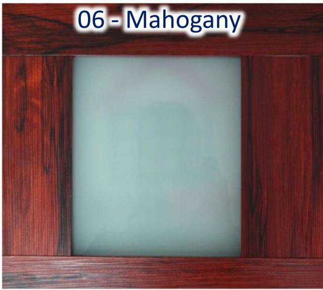
06 - Mahogany