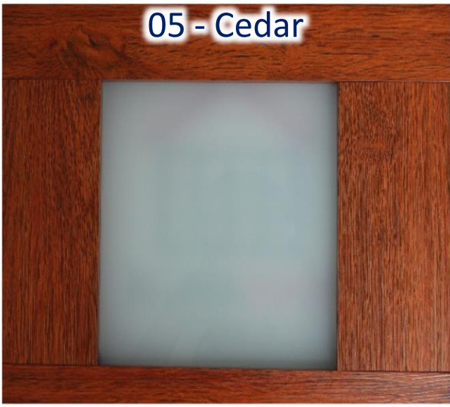
05 - Cedar